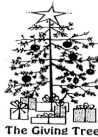
The Giving Tree